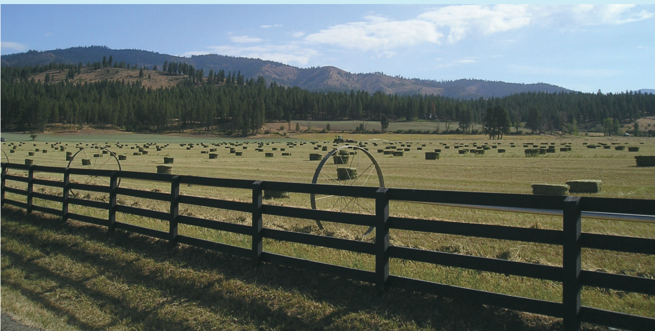
Good planning for future growth will help Forterra keep the impact of housing to a minimum for prime farmland in Kittitas County, Washington.