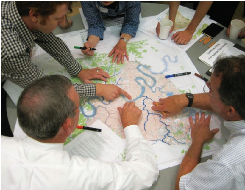
LAND TRUST FOR TENNESSEE

The Land Trust for Tennessee co-convended a public input session for the Nashville Open Space Plan held at Belmont University in Nashville, Tennessee, in 2010.